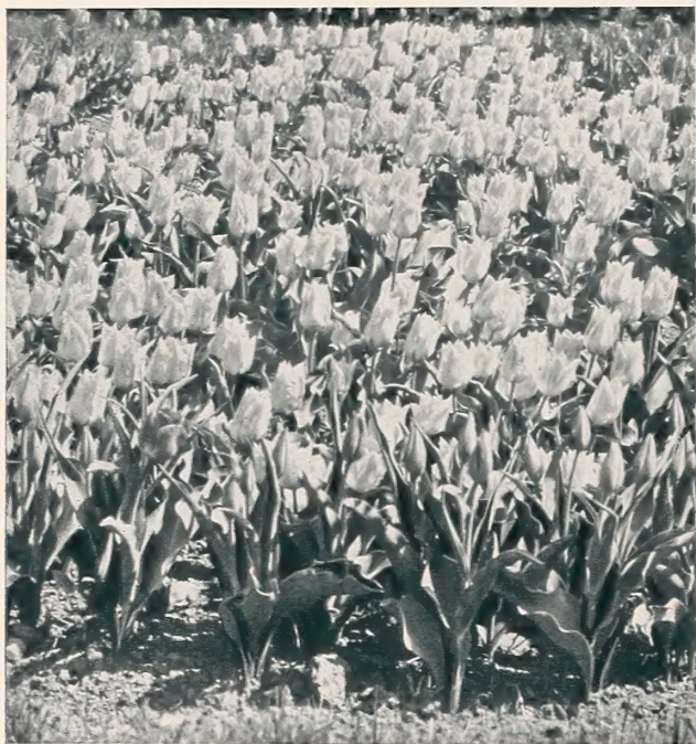
Single Early Tulips